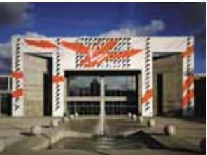
San Jose McEnery Convention Center 1989