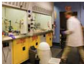
San Jose BioCenter 2004