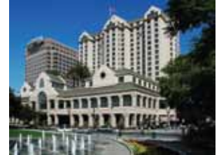
Fairmont Hotel 1987