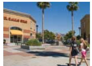
Plaza de San José 2005