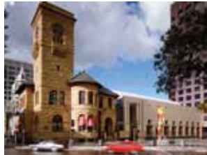
San Jose Museum of Art New Wing 1991