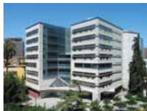
Dr. Martin Luther King Jr. Library 2003