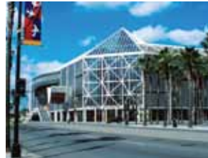
HP Pavilion/San Jose Arena 1993