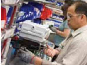
Rincon de Los Esteros Technology Park 1974 home to 66,000