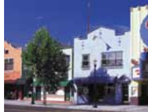
Neighborhood Business District Program Created 1984 to help small businesses