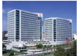
Adobe Systems Headquarters West/East Towers 1996/1998