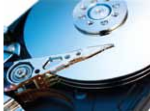
Edenvale Technology Park 1976 home to 13,500 jobs