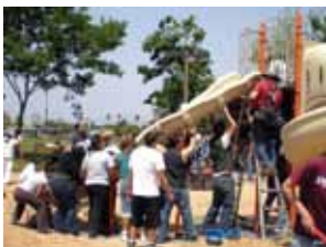
Strong Neighborhood Initiative Project Area Adopted 2002